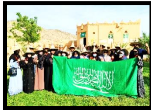
Al Amoudi Museum