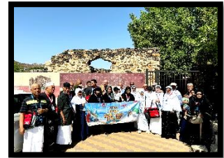
Historic Hudaibiyah Treaty